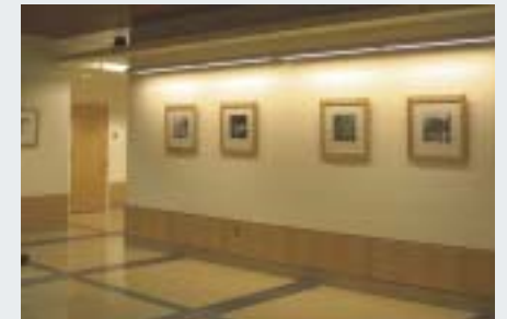
Engineering/Life Sciences Gallery