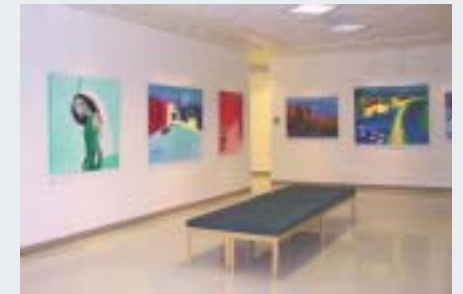
Student Services Gallery

Monday-Thursday: 8 a.m.- 9 p.m. Friday: 8 a.m.- 5 p.m.