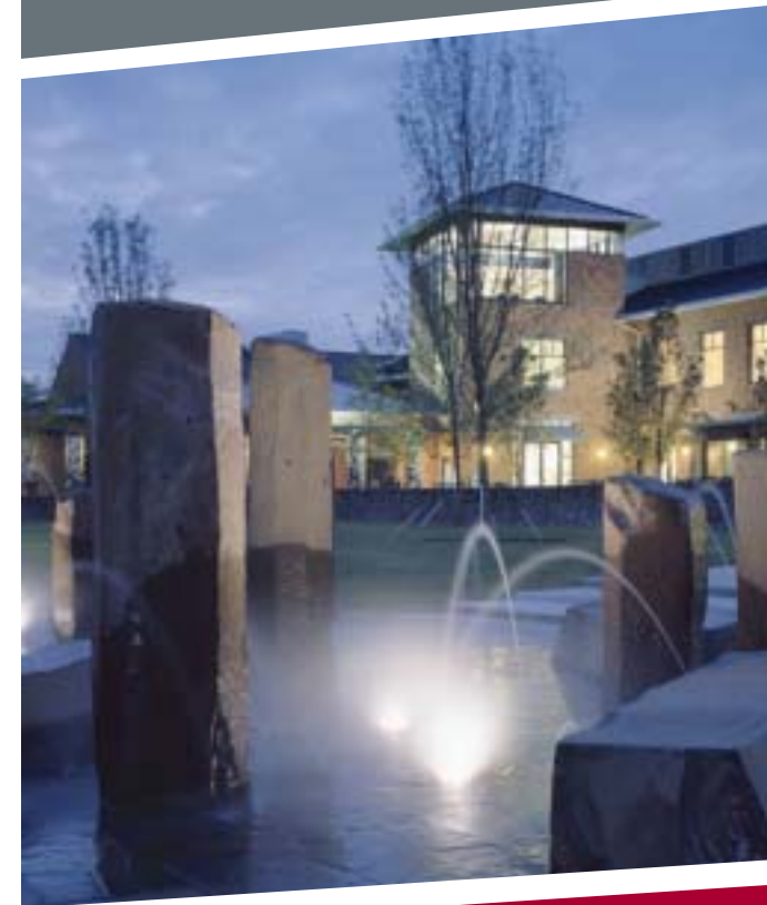
Firstenburg Family Fountain

"The natural beauty of the WSU Vancouver campus is only enhanced by its art galleries and public art pieces."