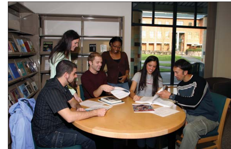
WSU Vancouver students meet for a study session in the reading room located in the campus Library.