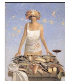
Cooking Lesson 300